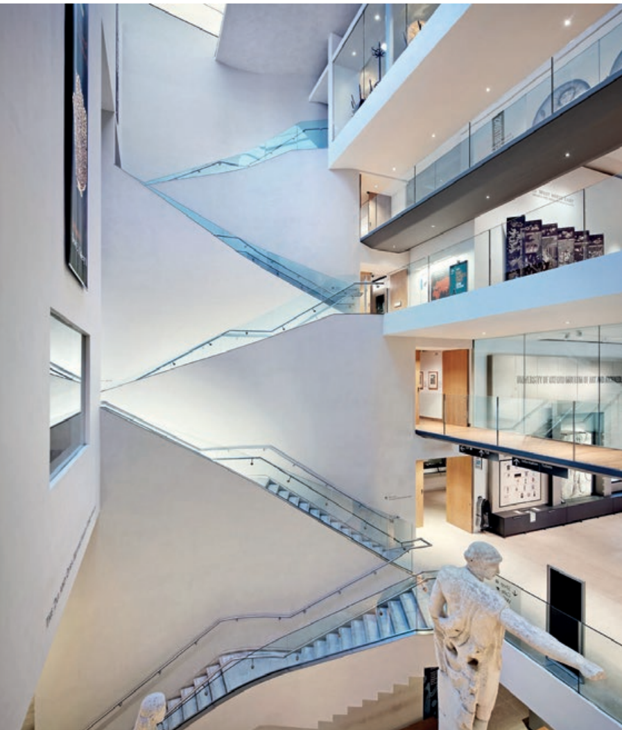
University of Oxford

high temperatures and the level of the UK's present resilience to them. Its publication coincided with record-breaking high temperatures across the UK. CIBSE made a significant contribution to the report, including the inquiry's findings and its recommendations to government. CIBSE is cited extensively in its recommendations on the Building Regulations and the wider regulatory framework.