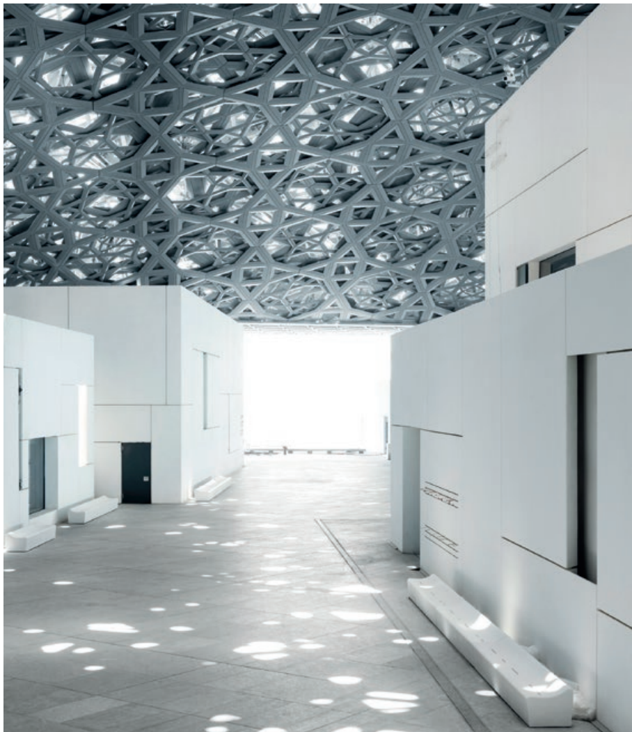
Louvre Abu Dhabi, BuroHappold Façade Engineering

The 18 Special Interest Groups cover topics ranging from day-lighting and lifts to controls and electrical services. Participation is open to all who are interested, whether or not they are CIBSE members. A key objective for the groups is to promote CIBSE membership.