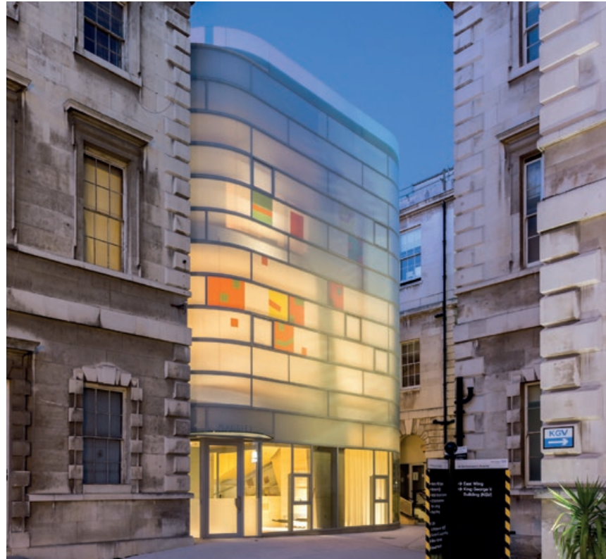
Maggie's Barts, Arup Façade Engineering and Sir Robert McAlpine