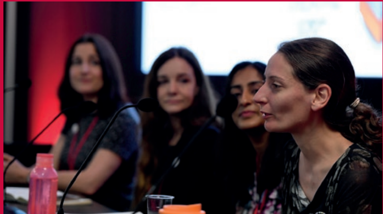
Women's Breakfast, Build2Perform Live