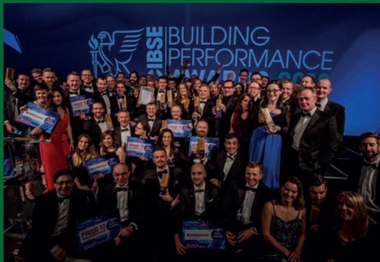
2018 Building Performance Awards winners