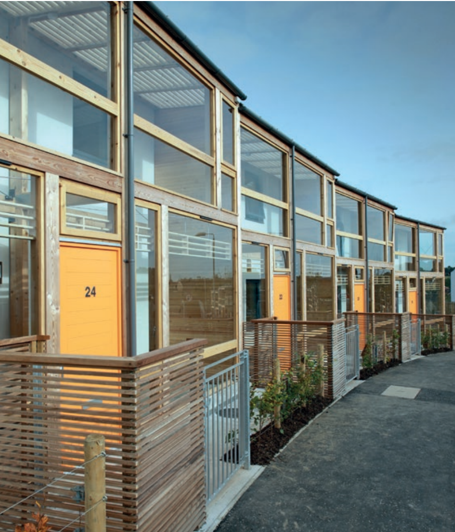
Killynure Green, Carryduff, Choice Housing Ireland