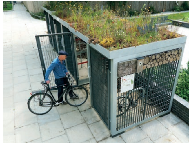
Green Roof Shelters