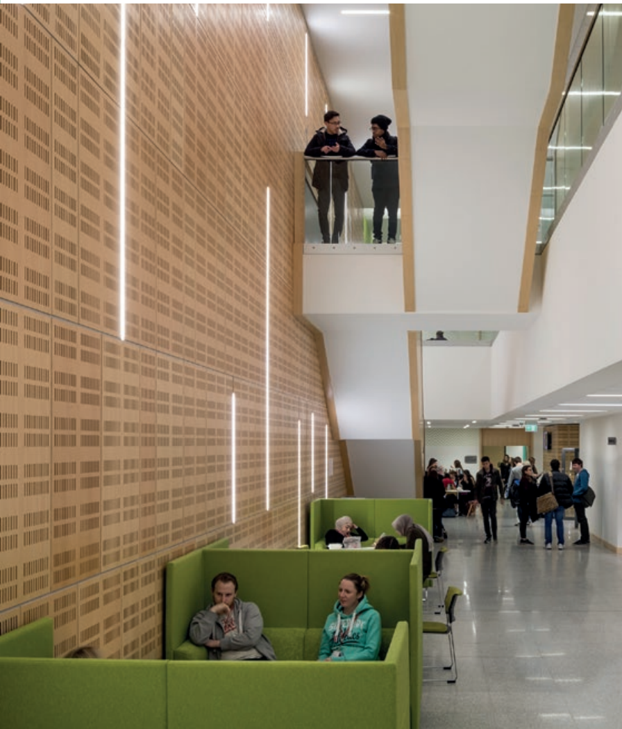
Centre for Medicine, University of Leicester, Willmott Dixon