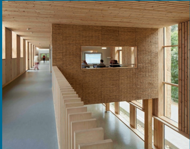
Front cover and above: The Enterprise Centre, Architype