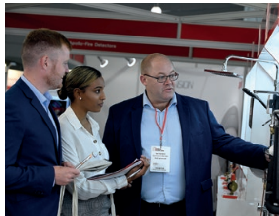
Build2Perform Live exhibition