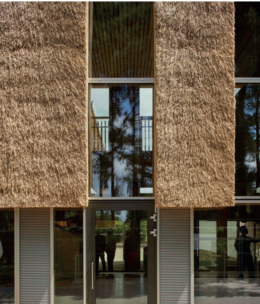
The Enterprise Centre, Architype