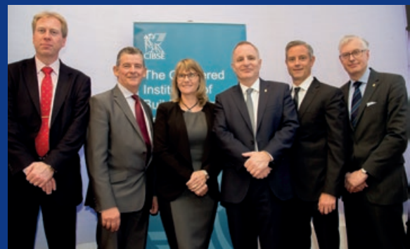
CIBSE AGM 2018